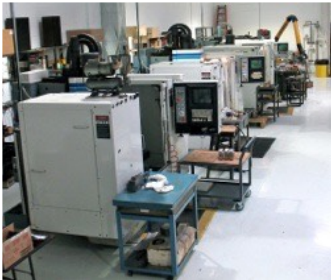
Automated Machining Centers