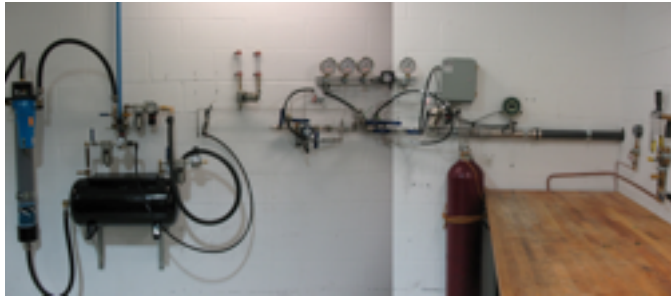
High Pressure Testing Center