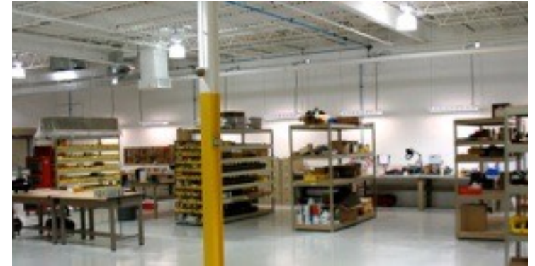
Booster Assembly and Test Area