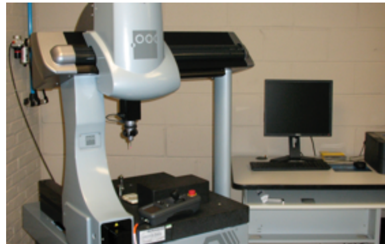
Coordinate Measuring Machine (CMM)