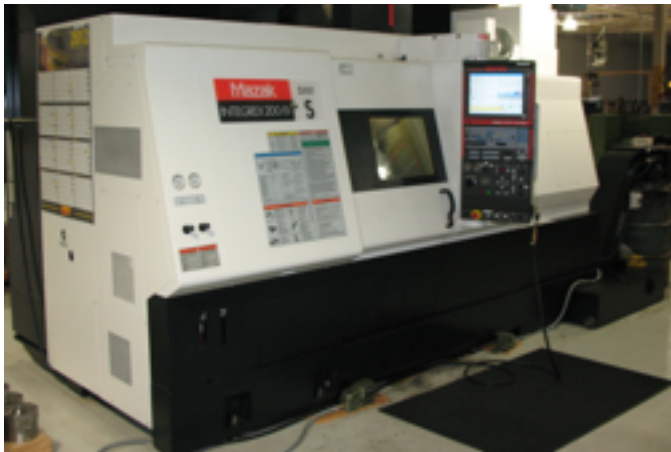
Mazak Integrex 200S